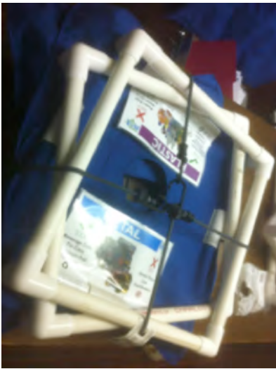
These are the tops and bottoms of two bins you will put together

<< Use two hands for this: One to cover/catch the clip; one to pull up on the fabric to release the clip.