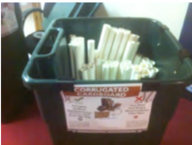
These are the legs for your bins, rubber banded together in groups of four

First image with one bag installed. Second image of bag that tore when stretched. Bags are large so by pulling down past the tear, you can still use the bag.