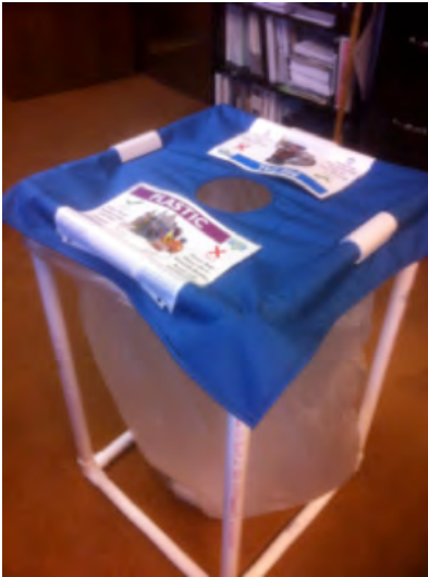
This is the finished bin you are going to assemble

CAREFULLY remove the white plastic clips holding the blue nylon top to the tops. NOTE: THIS IS IMPORTANT — holding your hand over the clip so it doesn't pop off and hit you, pull up on the fabric to release the clips. By pulling up on the fabric they release easily, where just trying to pull them off will take you hours and make for sore fingers.